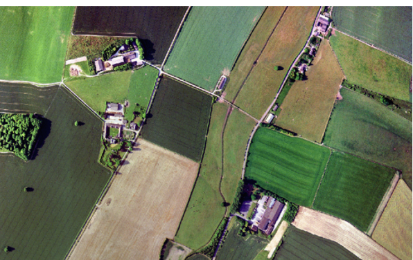
Aerial photograph of site context

The nearest residential dwelling is located at Auckland Farm approx. 120 metres to the northeast. Also illustrated in the aerial photograph above right, is the grade II listed Manor Farm House and the separately grade II listed farm steading - located circa 0.5km to the west beyond the road and a couple of fields. The large building block illustrated to the south of the application sit, beyond the agricultural barn that adjoins the site and some 0.25km distant is the Lyons Sea Food Ltd factory site.